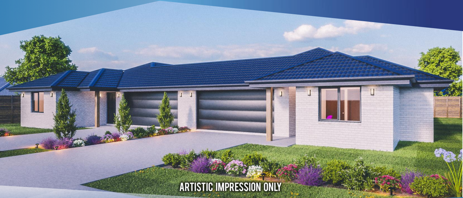
ARTISTIC IMPRESSION ONLY